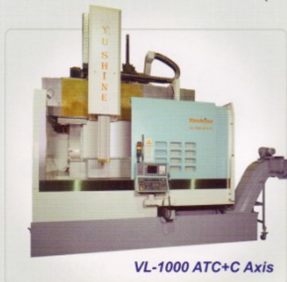
VL-1000 ATC+C Axis