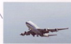
Taoyuan Int'l Airport