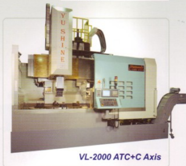
VL-2000 ATC+C Axis