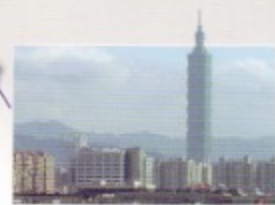
Taipei 101 Tower