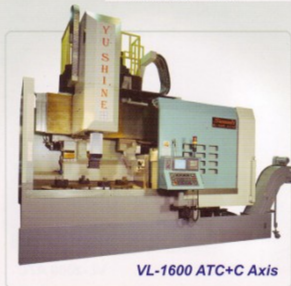
VL-1600 ATC+C Axis