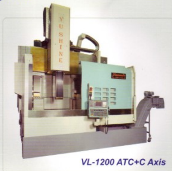
VL-1200 ATC+C Axis